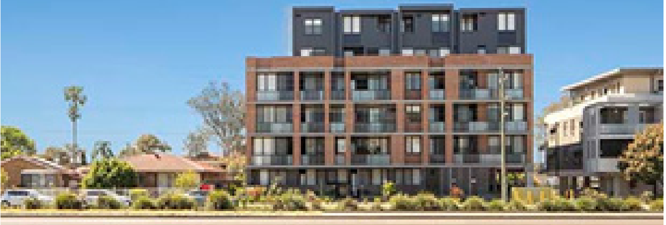
255 Hoxton Park Road, Cartwright