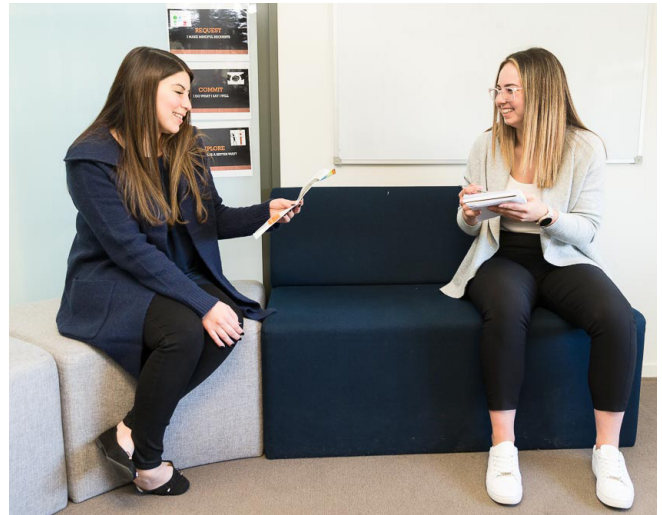
Team members at our Bonnyrigg Office