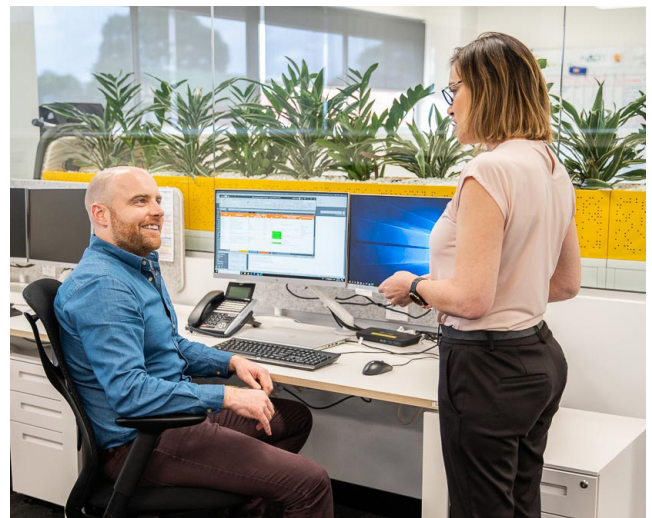
Team members at our St Leonards Office